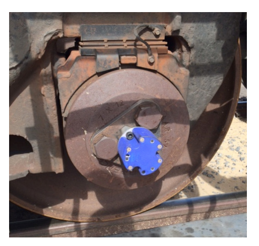
RailSafe RotoSense sensor module (blue) mounted on railcar axle hub

Because the robust RotoSense sensors — originally developed for rigorous NASA applications — are mounted on each end of an axle, right where the wheels and track meet, the three-dimensioned microelectromechanical systems (MEMS)-based instruments