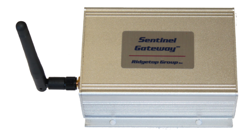
The Sentinel Gateway wireless data collection hub

RotoSense sensors are easy to install and use, and one on-board Sentinel Gateway™ IoT-enabled wireless data collection hub can receive and store data from 1,440 hours of operation across all the sensors on a car. The data can be compressed and uploaded to the cloud through an optional cellular connection, sent via Ethernet to another on-board data storage/processing device, or transferred manually for off-board analytics — or you can even install the RailSafe Toolbox on the train to alert operators to dangerous conditions in real time. The RailSafe Toolbox produces graphics depicting key performance parameters such as track or wheel state of health (SoH) and remaining useful life (RUL). No matter how you choose to use RailSafe, you will find it an indispensable yet affordable tool to keep your equipment in top operating condition.