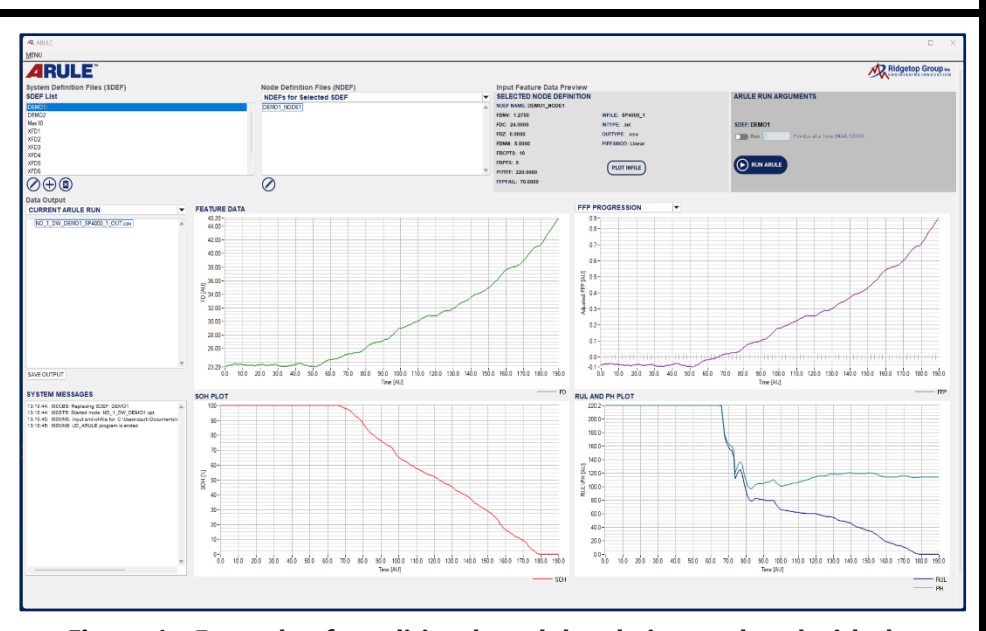
Figure 1 - Example of condition-based data being analyzed with the ARULE™ Graphical User Interface (GUI).

ARULE™ is versatile and can be used for determining electrical and mechanical fatigue damage