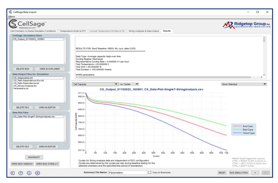
Example of Path Dependent Capacity Loss for best-case, average-case, and worst-case scenario in CellSage™ GUI

Under license from the U.S. Department of Energy's Idaho National Laboratory (INL), Ridgetop